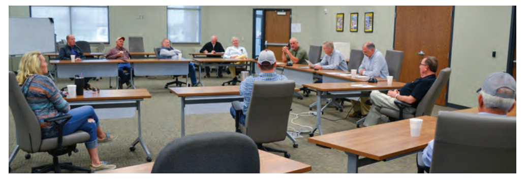
Attending monthly board meetings are part of the important role of each Rolling Hills Electric trustee.

It is already that time of year to begin the trustee election process. Please read through the qualifications and process for nomination of trustees for election outlined in the article below. NOTE: This process was revised in the bylaws in 2020.